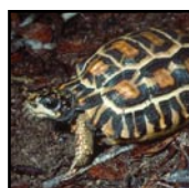
Flat-tailed tortoise Pyxis planicauda Madagascar (Madagascar and Indian Ocean Islands Hotspot) John L. Behler, Wildlife Conservation Society