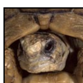
Egyptian tortoise Testudo kleinmanni S.E. Mediterranean (Mediterranean Basin Hotspot)

This list of the world's top 25 most endangered tortoises and freshwater turtles was compiled by the Turtle Conservation Fund (TCF)—a partnership of the Turtle Conservation Fund (TCF)—a partnership of the Center for Applied Biodiversity Science (CABS) at Conservation International (CI), The World Conservation Union Species Survival Commission's (IUCN/SSC) Tortoise and Freshwater Turtle Specialist Group (TFTSG), and IUCN/SSC Turtle Survival Alliance (TSA).