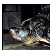
Philippine forest turtle Heosemys leytensis Philippine Islands