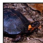
Bog turtle Clemmys mühlenbergii United States