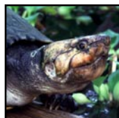
Madagascar big-headed turtle Erymnochelys madagascariensis Madagascar (Madagascar and Indian Ocean Islands Hotspot) Gerald Kuchling