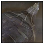
Striped narrow-headed softshell turtle Chitra chitra S.E. Asia (Indo-Burma Hotspot)