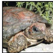
Southern speckled padloper tortoise Homopus signatus cafer South Africa (Succulent Karoo Hotspot)