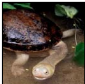
Roti snake-necked turtle Chelodina mccordi Southern Indonesia (Wallacea Hotspot)