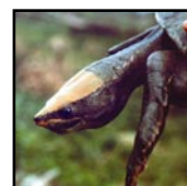
Central American river turtle Dermatemys mawii Central America (Mesoamerica Hotspot)