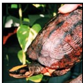
Chinese three-striped box turtle Cuora trifasciata Northern Vietnam & China (Indo-Burma Hotspot) Kurt Buhlmann, Conservation International