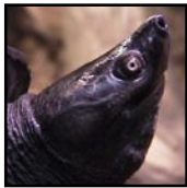
River terrapin Batagur baska S.E. Asia (Indo-Burma & Sundaland Hotspots)