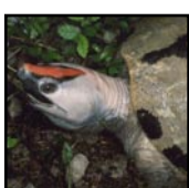
Painted terrapin Callagur borneoensis S.E. Asia (Indo-Burma & Sundaland Hotspots)