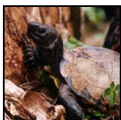
Arakan forest turtle Heosemys depressa Myanmar (Indo-Burma Hotspot)