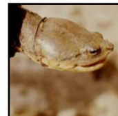
Dahl's toad-headed turtle Batrachemys dabli Colombia