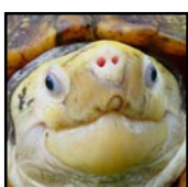
Sulawesi forest turtle Leucocephalon yuwonoi Indonesia (Wallacea Hotspot) Chris Tabaka, DVM