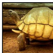
Ploughshare tortoise Geochelone yniphora Madagascar (Madagascar and Indian Ocean Islands Hotspot)