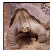
Abingdon Island tortoise (Galapagos Tortoise) Geochelone nigra abingdoni Galapagos Islands (Choco-Darien-Western Ecuador Hotspot)