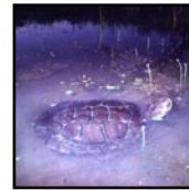
Western swamp turtle Pseudemydura umbrina Australia (Southwestern Australia Hotspot) Gerald Kuchling