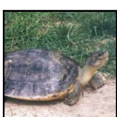
Burmese roofed turtle Kachuga trivittata Myanmar (Indo-Burma Hotspot) Gerald Kuchling