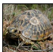
Geometric tortoise Psammobates geometricus South Africa (Cape Floristic Region Hotspot)